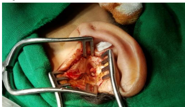
Figure-1: Endaural approach for right ear tympanoplasty type 1.

Tympanoplasty type 1 was performed by author himself, keeping in view universally accepted protocol for ear surgery. After intubation with general anesthesia of the patient in supine position, local anesthesia with local anesthetic of 2% xylocaine mixed in 1: 80000 epinephrines was injected into the meatus in all four quadrants and in tragus. The area of interested was properly scrubbed with pyodine solution and then draped.