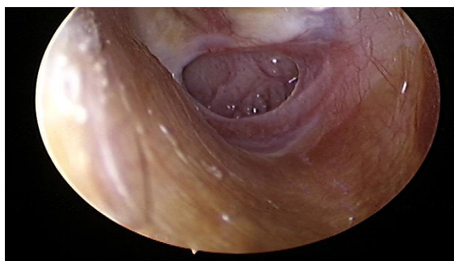
Figure-4: Left TM large central perforation.