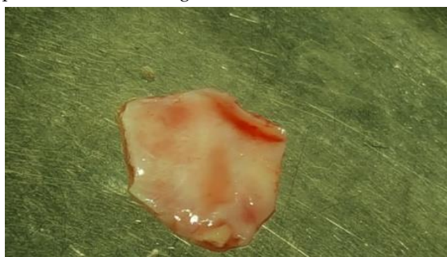
Figure-3: Tragal cartilage graft harvested.

recovered from anesthesia and shifted to ward for post-operative care. Patients were put on antibiotics, analgesics antihistaminic and vasoconstrictor nasal spray to keep eustachian tube patent. Patients were instructed to avoid straining, forceful nasal blowing and coughing. Every patient was called for follow up visit. On follow up visit otoscopy, endoscopy and PTA were performed and findings were noted.