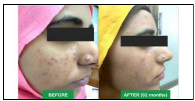
Figure-2: Before and After IPL treatment pictures of the Patient