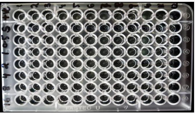
Figure-1: 96 well microtiter inoculated plate.

Each plate had sterility and growth controls as well. Colistin Sulfate powder (Sigma-Aldrich: Lot No: LRAA4721) was used to make an antimicrobial solution of 32 ug/ml concentration, diluted two folds over six wells from 16 ug/ml to 0.5 ug/ml. Each well was inoculated with 0.05 ml of antimicrobial agent except growth control well. Isolate inoculum was prepared to a final density of 5x10^5 CFU/ml, and 0.05 ml was dispensed in each well except sterility well. This inoculum was also applied on a quadrant of Blood agar and MacConkey agar to rule out any contamination during this procedure.