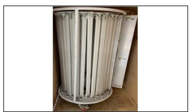
Figure-1: Ultraviolet-C emitting device, perceived and designed by engineer Najam Ul Hassan.

these surfaces<sup>1,11</sup>. As most of the surfaces frequently touched by health care workers in the hospitals are made up of these materials. There is a potential hazard of contracting coronavirus via touching these surfaces. It has been shown that the virus survives better at 30-50% humidity for 2 hours to 9 days at room temperature in a closed room environment and surfaces<sup>12</sup>.