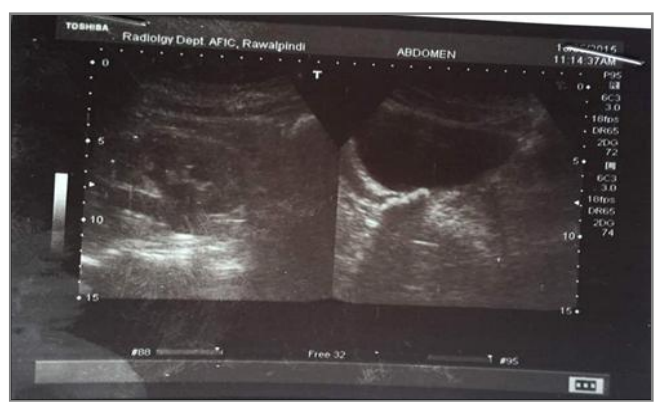
Figure-1: Ultrasound abdomen.

Extra corporeal shock lithotripsy was done for the right kidney stones which led to the excretion of right renal calculus mass in two weeks. Minimal invasive parathyroid surgery was planned on date 30th June, 2015 under perioperative ultrasound guidance and perioperative PTH assay. Minimal Invasive Parathyroidectomy was performed. A focused lateral mini-incision approximately 2.0 cm in length was applied on left side