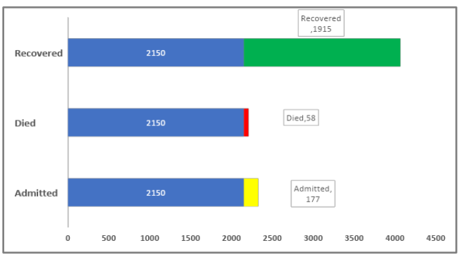
Figure-2: COVID-19 Azad Jammu & Kashmir; scenario at a glance.

lower most place during the peak time. During this time period, highest number of confirmed patients reported was 83 on July 14th 2020. The total positivity rate for AJK is 7% up till August 10th 2020 with 2.79% Case Fatality ratio and 89.07% Cases Recovery ratio. It is pertinent to mentioned here that, at the point where the lines leave the box, it is evident that there is a sharp decline in the red line with a sharp increase in