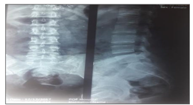
Figure-1: X-Ray L/S, showing LSTV type III-b on AP view and squaring of LSTV on lateral view.

Statistical analysis was done on SPSS-22. Percentage of each Castellvi type was calculated. Percentage of patients with and without disc degeneration was calculated. Also the percentage of all Castellvi types associated with disc degeneration was calculated. Mean age with standard deviation was calculated for both groups with