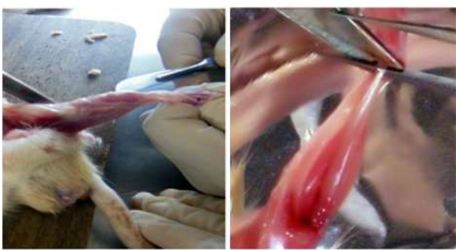
Figure-1: Showing dissection of rat hind limb and isolation of extensor digitorum longus.

The body weight of all the animals was recorded at the start of the study and before sacrificing the animals. 5ml sample of blood was taken in a plain tube directly from the heart for the quantitative measurement of creatine phosphokinase (CPK) levels before sacrificing of the animals. The samples were labeled according to the groups. The animals were sacrificed after