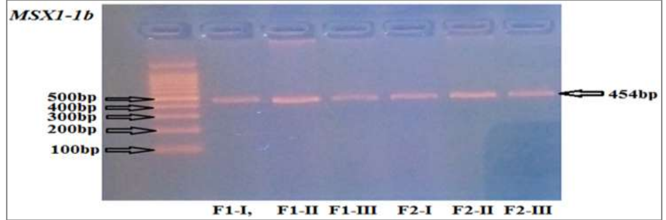
Figure-2: Agarose gel electrophoresis of exon 1 of MSX1_1b gene of family 1 (F1) and family 2 (F2).

enrolled for current study. The study was conducted according to the tenets of the declaration of Helsinki. Written inform consent was obtained from all adult participants and their parents in case of minors.