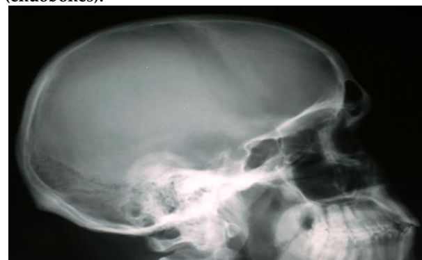
Fig-4: Sclerosis of the skull base