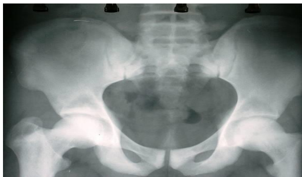
Fig-3: Increased bone density of the iliac crests, sacro-iliac joints, symphysis pubis, ischael tuberosities and acetabulum, more pronounced on the right side (endobones).