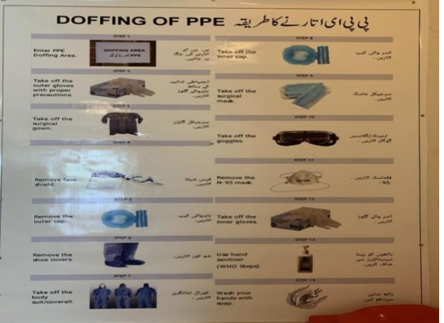
Figure-3: Education poster- doffing of personal protective equipment (PPE).

used to prevent intra hospital spread of infection. All transporters are required to practice full IPC measures.