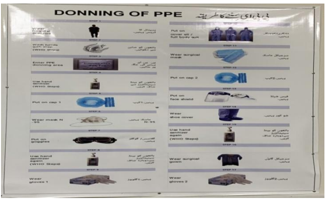
Figure-2: Education poster - donning personal protective equipment (PPE).

For ventilated patients, two transport ventilators are available. All patients are covered in a talc tent, while non ventilated are required to wear face mask. All tubing and equipments are sprayed with alcohol/0.5%hypochlorite sprays. Dedicated pathways, lifts and ambulance are