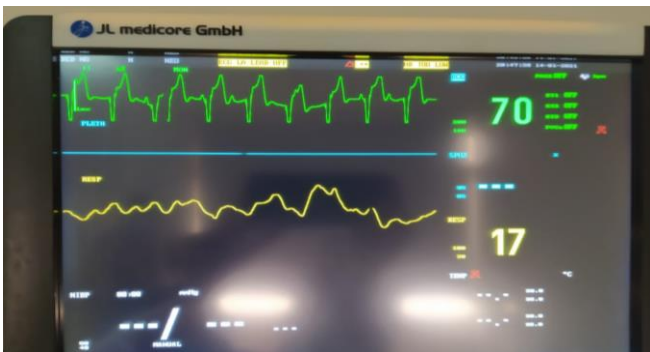
Figure-3: Post Pacemaker Implantation Rhythm and Rate

Functionality of pacemaker lead was assessed by Electrophysiology team followed by battery placement in left infraclavicular subpectoralis region by cardiac surgeon in the cath lab. The patient was discharged home in a hemodynamically stable condition on the 5th day (Figure-3).