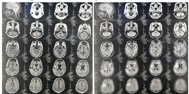
Figure-1D & E: MRI brain repeated 6 weeks later.

Biopsy from cerebral lesion was performed to confirm our initial diagnosis and for drug resistance. Histopathology of the tissue revealed necrotizing granulomatous inflammation and cytology of the fluid ruled out malignancy. Culture was negative for tuberculosis and showed weak acid fast bacilli, identified as Nocardia Asteroides sensitive to Impinem, Amikacin, and Trimethoprim. Treatment plan of patient was altered accordingly. Over next few weeks, patient improved significantly. MRI brain was repeated after 6 weeks that in comparison to the previous scan revealed reduction in number and size of lesions thus showing disease regression (Figure-1D & 1E). Patient was continued same treatment for 12 months with monthly follow-up and three monthly MRI.