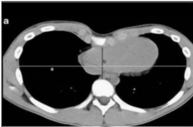
Figure-1: A Line is drawn from the posterior surface of sternum to the anterior surface of the vertebral body (line b). Another line drawn horizontally measuring maximal width of the thoracic cage (line a). The Haller's index was calculated by dividing the maximal width of thorax by antero-posterior height (Haller Index= a/b)

Images were stored and retrieved from the GE PACS system. An axial slice of the CT scan at the site of maximum deformity (where the chest anteroposterior dimension was the least) was chosen. A line was drawn from the sternum's posterior surface to the vertebral body's anterior surface (line b). At the same level, another line was drawn horizontally, measuring the thoracic cage's maximal width from the ribs' inner margins on either side (line a). Haller's index was calculated by dividing the maximal width of the thorax by anteroposterior distance (Figure-1).