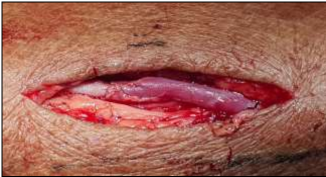
Figure-2: The Final Creation on Distal RCAVF End to Side Anastomosis In a 80 Years Old Gentleman . Patient had a Good on Table Thrill. Successful Hemodialysis were Started After 6 Weeks