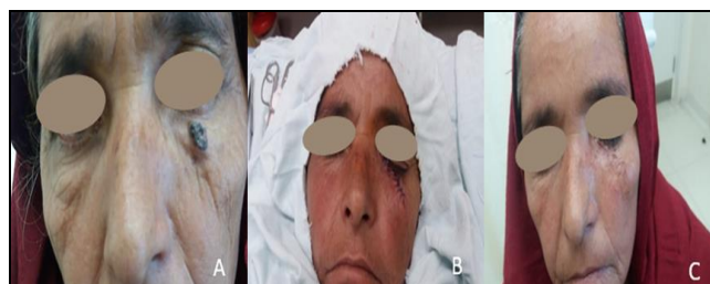
Figure-1: a) Basal Cell Carcinoma, (b) Direct closure, c) Scar at 8 weeks.

In this study 27 patients of BCC on the face were included. Thirteen had surgical excision at Dermatology Department, 7 at Plastic Surgery Department at Multan. Seven received treatment at Dermatology Department Karachi. There were 11 (37.9%) males and 16 (59.25%) females between ages of 45-70 years mean age was 56.63 \pm 7.71 years. There were 17 (62.96%) house wives and 10 (37.03%) were retired soldiers. BCC was located on the cheek in 15 (55.50%), nose in 9 (33.30%), temple 2 (7.40%) and forehead 1 (3.70%) cases. Direct closure was performed in 6 (22.20%), rotation flaps in 10 (40.70%), and advancement flaps in 11 (40.70%). Surgical techniques of direct closure (Figure-1 a, b & c), rotation flap (Figure-2 a & b), and advancement flap (Figure-3 a & b).