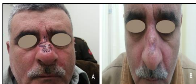
Figure-2: a) Rotational Flap following BCC Surgery Nose, b) Scar at 8 weeks.