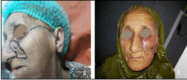
Figure-3: a): BCC reconstruction plan with cheek advancement flap, b): Scar at 8 weeks.

POSAS was used at 8 th weeks. Patient score for variables of texture, irregularity, stiffness, color itch and pain for rotation, advancement flaps and direct closure are shown in (Figure-4). Observer component of POSAS for surgical techniques on parameters of pliability; surface area relief, thickness, pigmentation and vascularity are shown in (Figure-5).