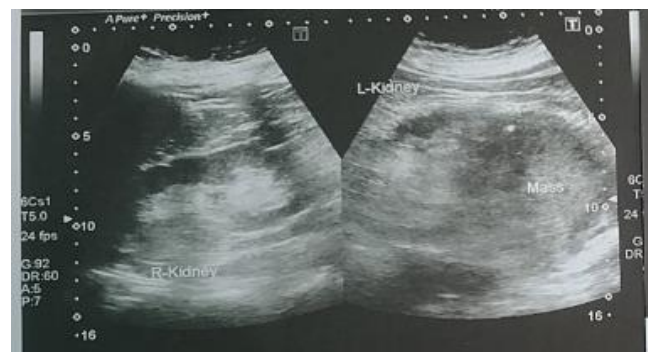
Figure-2: Ultrasonography of left kidney.

CT scan was not performed due to raised serum creatinine. Considering the high suspicion of renal cell carcinoma in the previous CT scan report, a left radical