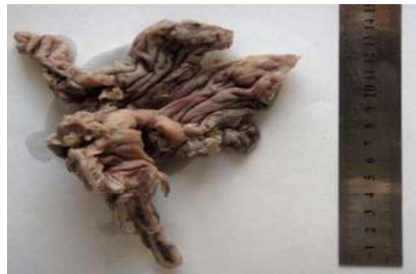
Figure-2: Gross morphology of right sided limited hemicolectomy.

inner zone and a fine outer zone. Partially digested bacteria with iron and calcium phosphate are present in the central zone. Gradual deposition of calcium leads to the typical concentric laminations of MG bodies 2 . MG bodies are stained with PAS diastase, von Kossa and