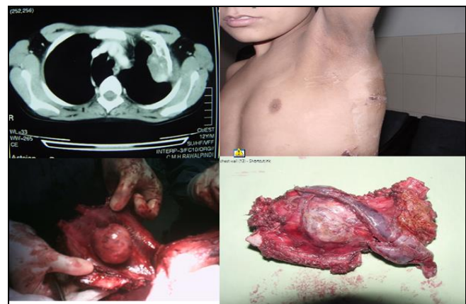
Figure-2: Patient ewing sarcoma chest (CT Scan on the upper left corner and resected specimens in lower two pictures).

All patients showed partial response to neoadjuvant chemotherapy as per RECIST criteria. However, no complete response was seen. Primary reconstruction was done following resection of the tumour and confirmation of negative margins. The soft tissue coverage was provided using Latissimus Dorsi Muscle Flap in 16 cases (84.21%) and in 3 patients (15.79%) Rectus Abdominis muscle was used. Most of the patients had eventless recovery with post-operative morbidity (Figure-2).