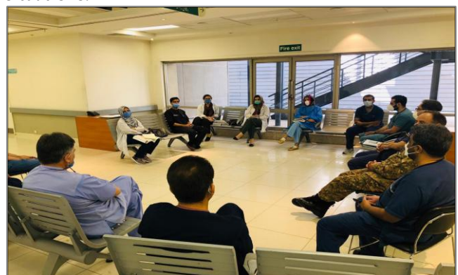
Figure-4: Academic clinical session with residents in COVID-19 environment.