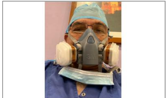
Figure-3: N95 respirator mask with filters for high risk situations.