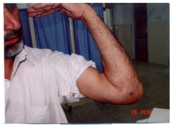
Fig. 6: Range of motion (flexion).