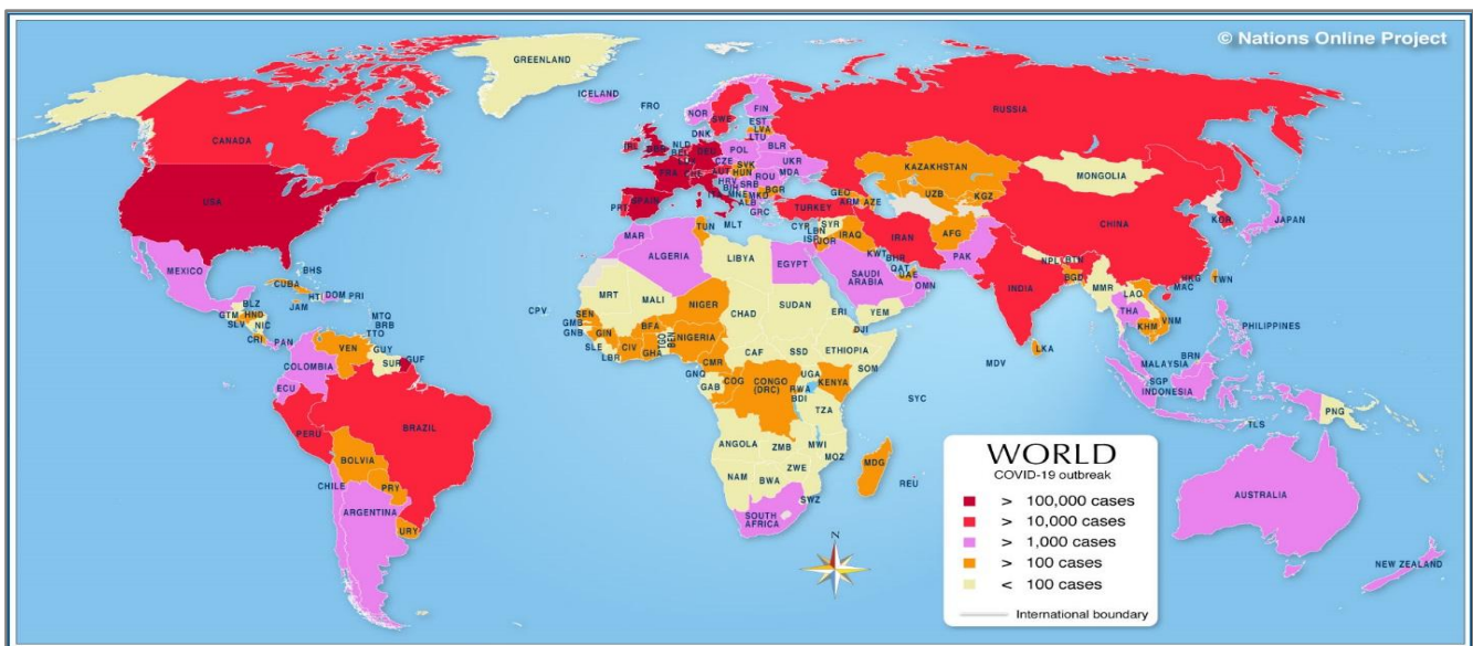
Figure-3: World Map showing COVID-19 Peak Cases.

Zimmermann et al , concluded that children may not develop symptoms similar to adults, but may report positive for COVID-19. They compared different forms of novel corona virus (including circulating human corona virus (HCoV), SARS-COV, MERS-COV, and SARS-COV-2. SARS-COV-1 and SARS-COV-2 had zoonotic origin (mainly bats) and reported fever among 91-100% and 44-50% of the total cases respectively. Cough in pediatric patients 43-80%