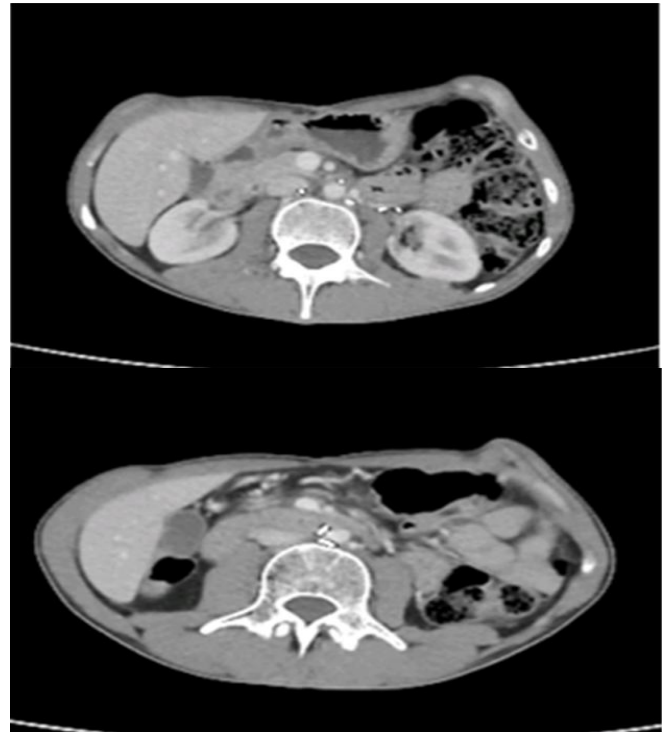
Figure-2: End of treatment scan showing complete resolution of nodal disease.

Chemotherapy is routinely prescribed since rhabdomyosarcoma is a chemosensitive disease and radio-