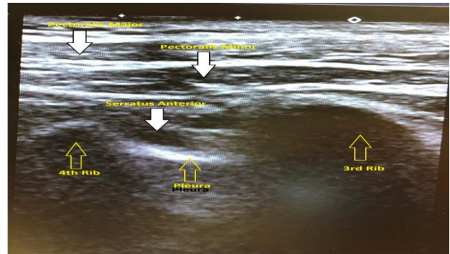
Figure-1: Sono-anatomy of PECS II Block.

(pneumothorax, hematoma formation and local anaesthetic toxicity) and untoward effects of analgesics e.g. nausea, vomiting, dizziness or respiratory depression were also recorded. Quantitative variables like age, weight, BMI were presented in the form of mean \pm SD and range. SPSS-20 (Chicago, Illinois) was used for statistical analysis. Independent sample t-test was used for statistical analysis of nominal data. The p < 0.05 was considered significant.