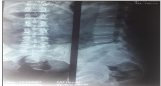
Figure-1: X-Ray L/S, showing LSTV type III-b on AP view and squaring of LSTV on lateral view.

Statistical analysis was done on SPSS-22. Percentage of each Castellvi type was calculated. Percentage of patients with and without disc degeneration was calculated. Also the percentage of all Castellvi types associated with disc degeneration was calculated. Mean age with standard deviation was calculated for both groups with