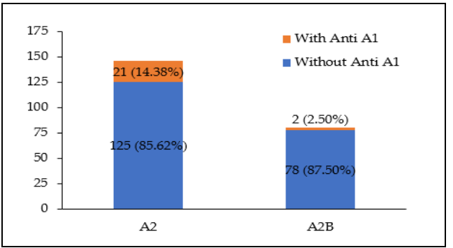
Figure-3: Frequency of anti-A1 antibody in A2 and A2B blood groups.