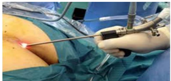
Figure-2: Introduction of fistuloscope through exterior opening.