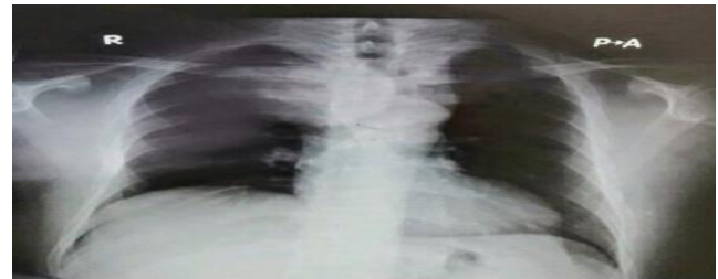
Figure-1(a): A mediastinal shadow was visible on the right side in chest x-ray.

thoracotomy in 4 th intercostal space in first stage. Three weeks later, in second stage, through a