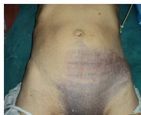
Figure-1: Ecchymosis of the left lower abdomen and groin in a patient with ruptured AAA.

On examination, his vital signs were within normal limits and cardiovascular and respiratory examinations were unremarkable. His abdominal examination revealed distension with ecchymosis