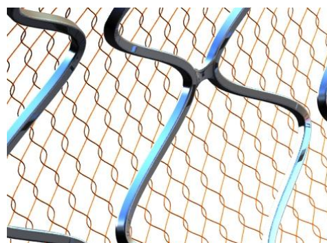
Figure-2: The stent struts and covering sleeve is shown clearly.

balloon dilatation that fractures the intima and the plaque. Because there is superimposed thrombus on the intimal plaque occluding the vessel during an acute coronary syndrome, the embolic potential is high. Depending upon the thrombus burden embolised the consequences can vary from a simple sluggish flow to myocardial infarction and death. This can lead to what is known as the “no-reflow