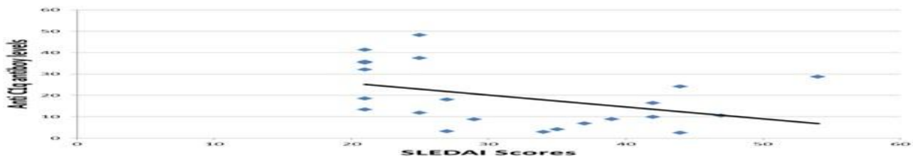
Figure-III: Correlation of anti C1q antibody levels with SLEDAI scores in patients with moderate disease (n=22).

r = -0.407 (pearsons correlation coefficient), r^2 = 0.16 , p = 0.007